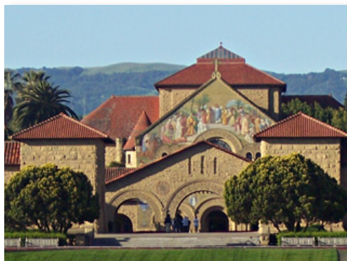
Asian Leadership Academy received initial financial support from Stanford GSB's Center for Social Innovation.

We came back to Stanford with a strong determination to bring this experiential leadership learning to Asia.